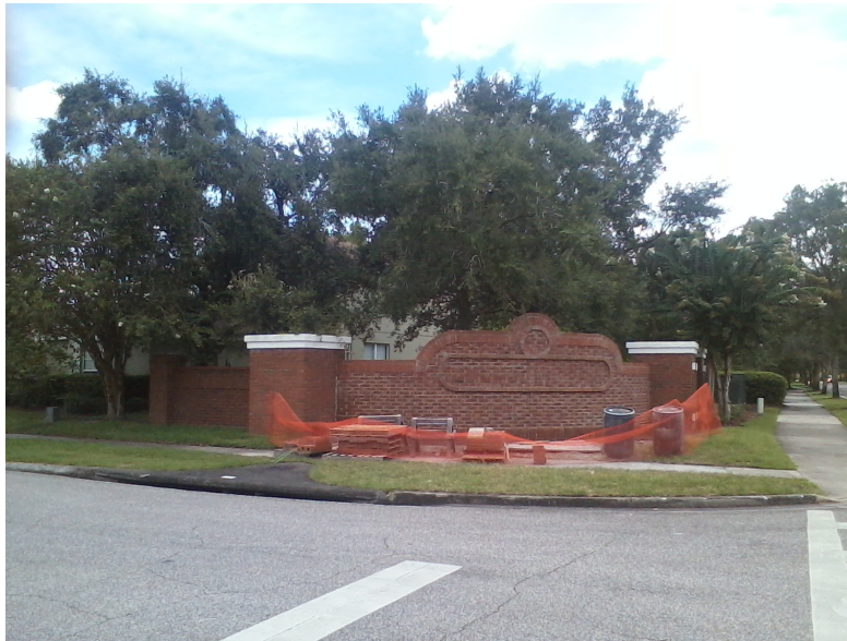
The wall on August 3rd

Contractors have excavated the area, checked for foundation damage, and are restoring the wall and its front garden area. After the masonry is finished other contractors will replace the signage, restore the irrigation lines, and reinstall electric service. Then we can once again enjoy the view.