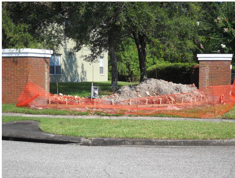
The wall on July 16th

Remember how the wall looked after the March 4 th crash? It looks a lot better now. Progress from July 16 th to August 3 rd is shown below.