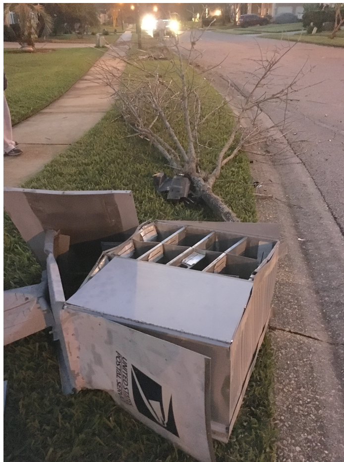
A speeder destroyed this tree and this mailbox on January 9 th . Luckily he also disabled his own SUV and was apprehended.

Speeders on Spring Island Way continue to pose a danger to humans, animals, trees, and anything else in their way. Not the first, but the most extreme recent case happened on January 9 th when a speeder plowed into a tree and a mailbox in the 700 block of Spring Island Way. The impact moved the concrete base of the mailbox about 4 inches before ripping the mailbox away and pushing it and a tree about a block down the road. Unfortunately (for him) the collision ripped open his undercarriage fluid lines and disabled the SUV. Fortunately (for us) the SUV came to a stop near a deputy's house and the driver was apprehended.