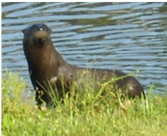
Otto returns, April 12 th

Otto's latest appearance was on April 12 th back in the Divine Circle pond. Here's the latest photo.