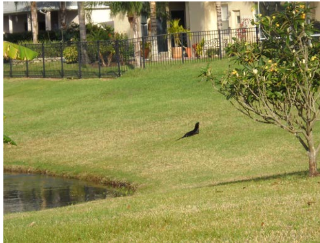
Otto the Otter first sighted on February 28th