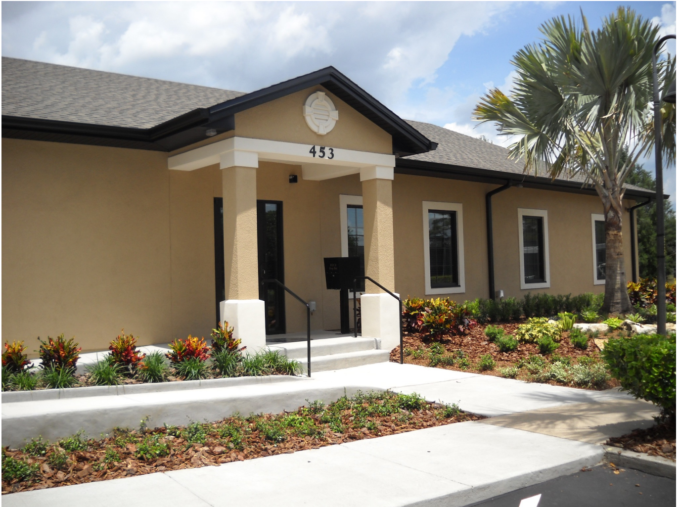
Cypress Isles now meets in the WLCA Community Building 453 Mark Twain Boulevard

Can't make it on the 17th? Then PLEASE fill out a proxy and return it by May 16th to the Secretary at 726 Divine Circle.