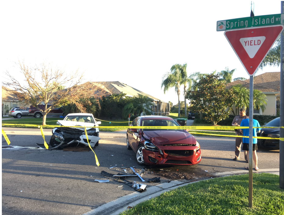
Crash on Spring Island Way at Lakes Way, 3/10/2017