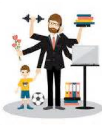
Happy Father's Day – June 19 th