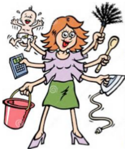
Happy Mother's Day – May 8 th