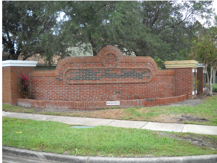
Wall 3.0 - October 30, 2019

send the check, which was the same as last time. (It was the same insurance company, so they already knew Cookie.) This time, however, the masonry was completed in only 3 weeks compared to the 14 weeks it took last year, so “Wall 3.0” is at least standing.